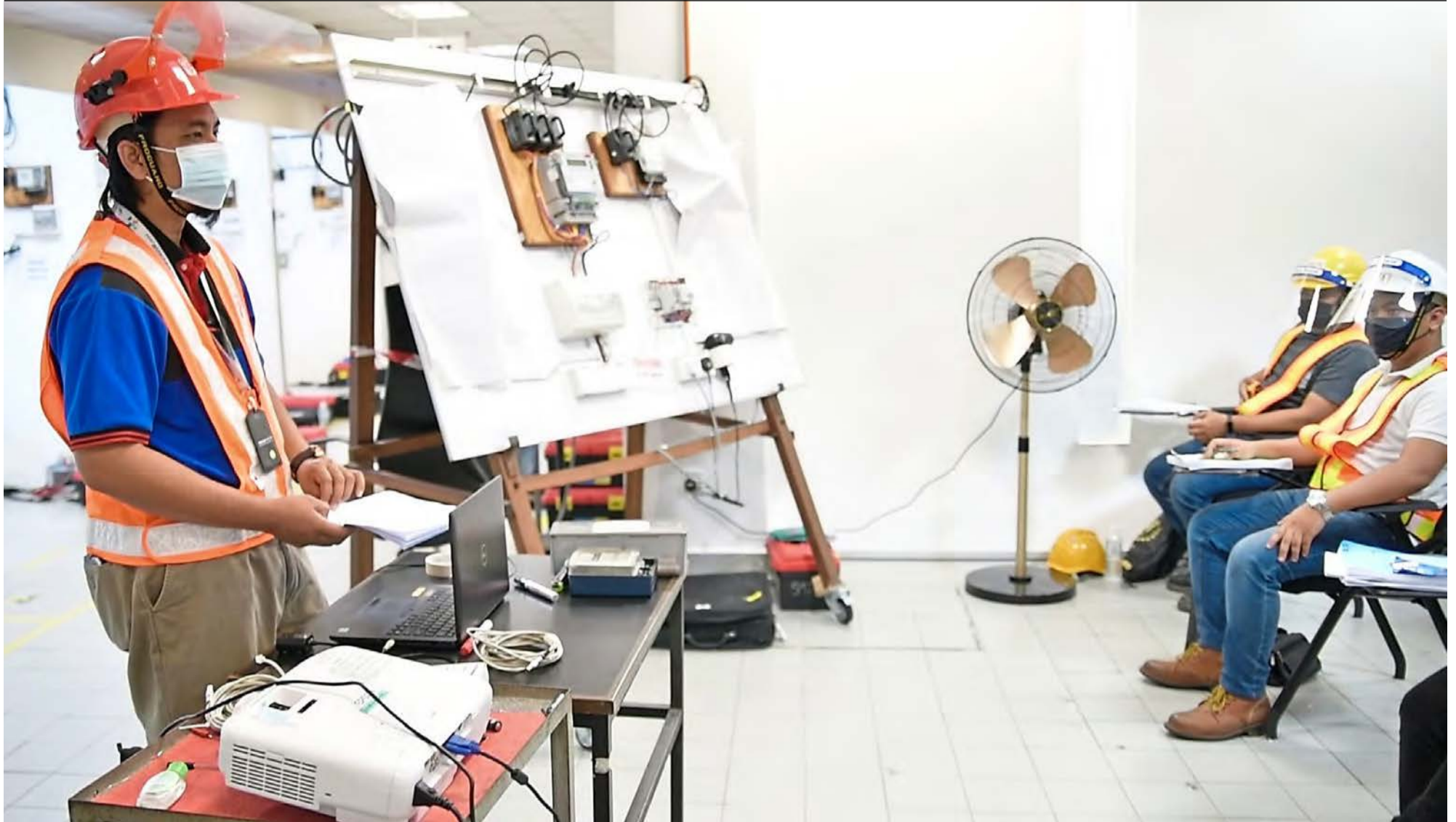
TNB Reskilling Malaysia supports companies by providing recruitment services and candidate sourcing for their business development.